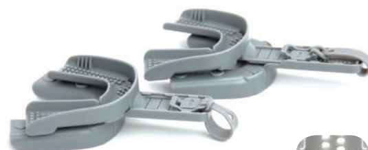
Advances at 1mm increments across full range of protrusion settings