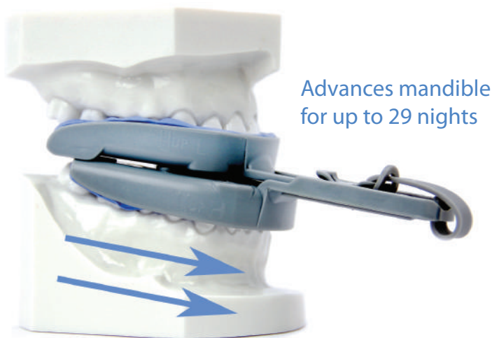
Advances mandible for up to 29 nights