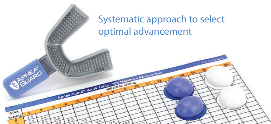
Systematic approach to select optimal advancement